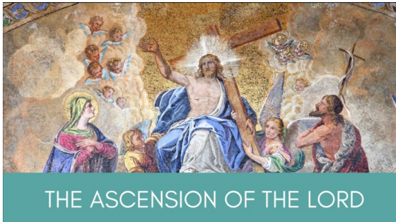
THE ASCENSION OF THE LORD

Our Lady of Mount Carmel | 27 Main Street, Easton, MN 56025 | Sunday Mass 10:00 am St. Casimir Church | 320 2nd Ave SW, Wells MN. 56097 | Sunday Mass: 8:00 am St. John the Baptist Church | P.O. Box 158, Minnesota Lake, MN 56068 | Mass: 4:00 pm