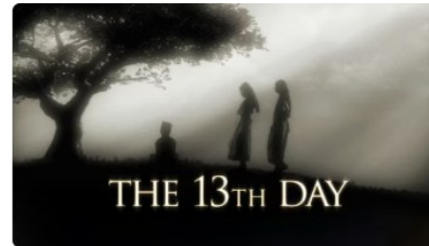
The 13th Day