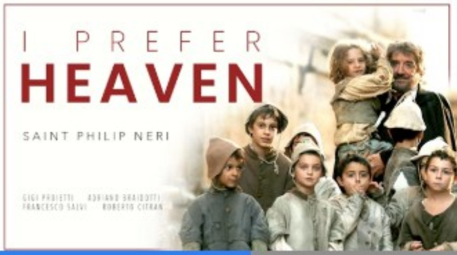
Saint Philip Neri: I Prefer Heaven