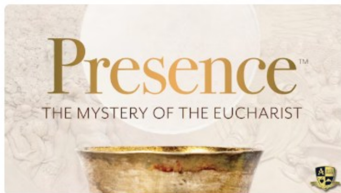
Presence: The Mystery of the Eucharist